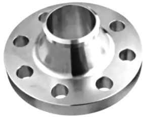
Weld Neck Flange(WN)

Depending on the type of connection between the tube and the flange, these can be divided into the following basic types: