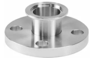
Lap Joint Flange(LJ)